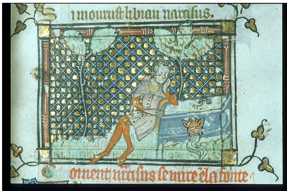
British library, Egerton 881 f.11